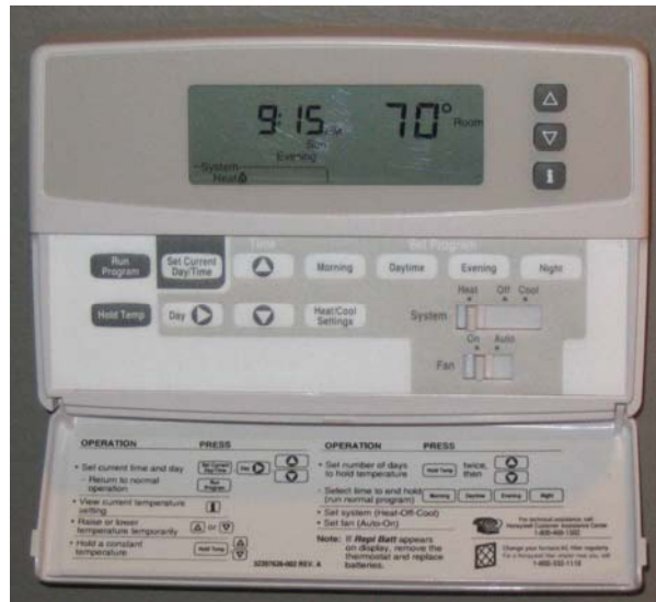
Example of Setback Control

Setback Temperature: An automatically timed setting of a thermostat to a lower (setback) temperature in the buildings during nights and weekends in winter and higher temperature during summer.