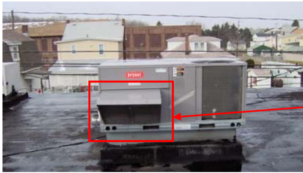
Example of Economizer