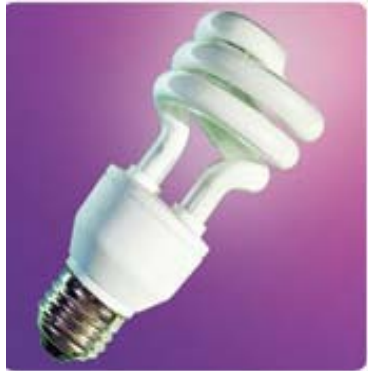
COMPACT FLUORESCENT LAMP