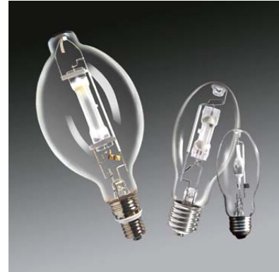
METAL HALIDE LAMP