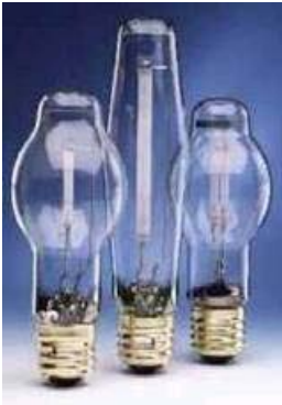
HIGH PRESSURE SODIUM VAPOUR