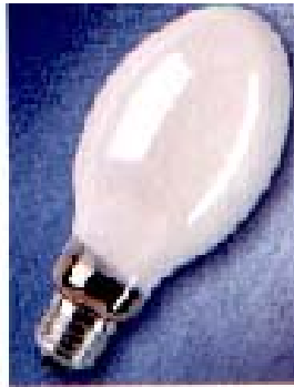
HIGH PRESSURE MERCURY VAPOUR